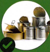
Aluminum & Tin Cans