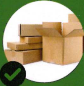
Corrugated Cardboard & Paper Bags (please flatten boxes)