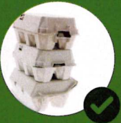
Food Boxes, Paper Egg Cartons, & Paper Towel Rolls