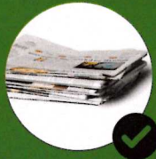
Mixed paper, Junk Mail, Magazines, Newspapers & Phone Books